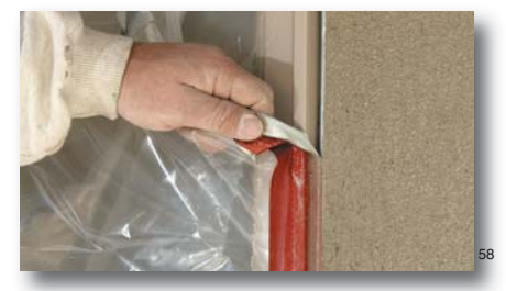
Strong backing of 3M™ Outdoor Masking and Stucco Tape 5959 pulls through stucco, EIFS, and other heavy coatings in one piece.