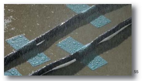
Waterproof backing of 3M^{\text{TM}} Performance Plus Duct Tape 8979 resists moisture and rain for up to a year.