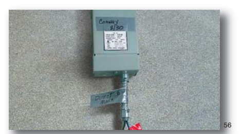
Write on the surfaces of many 3M<sup>™</sup> Duct Tapes with pen or marker to leave a reminder or mark and identify works-in-progress, components, items bundled, and more.