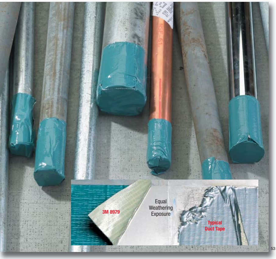
For temporary capping of pipes or conduit, 3M^{\mbox{\tiny M}} Performance Plus Duct Tapes 8979 and 8979N conform and adhere to metal and plastic. Strong backing keeps out water and dirt for up to a year even in outdoor storage.